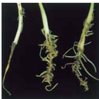
Roots show varying degrees of infection by Rhizoctonia.

Roots are poorly developed and distinct dark brown spots are visible, with few lateral roots. The tap root is brittle.