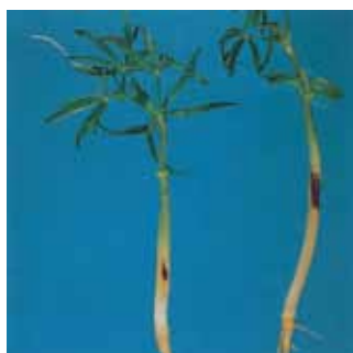
Rhizoctonia infection on hypocotyl of lupins.

Note the most severely affected have no lateral roots.