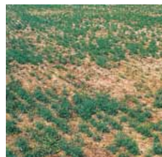
Patches of stunted plants in a lupin crop caused by Rhizoctonia.