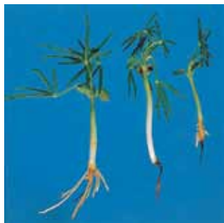
Brown leaf spot on lupins.

Dark brown lesions appear on tap and lateral roots. Can rot away completely causing the plant to wilt & die before the four- leaf stage